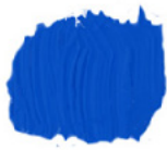
FRENCH ULTRA MARINE BLUE (T)