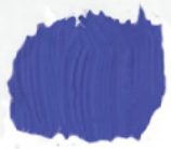
DIOXAZINE PURPLE (T)