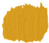
CAD YELLOW HUE