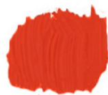
CAD ORANGE HUE