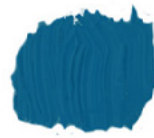
PHTHALO TURQUOISE (T)