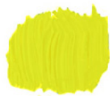
LEMON YELLOW HUE