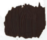
TRANSPARENT BROWN OXIDE (T)